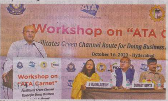
DP Naidu, Principal Commissioner, Hyderabad Customs Commissionerate, speaking at ATA Carnet workshop in Hyderabad on Monday

Naidu said, "Hyderabad air cargo has International courier terminal for export at International airport, shortly we are facilitating courier imports also in a couple of weeks, currently import cou-